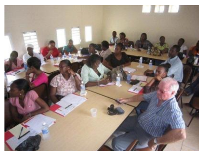
Step by Step advanced course in Dominica